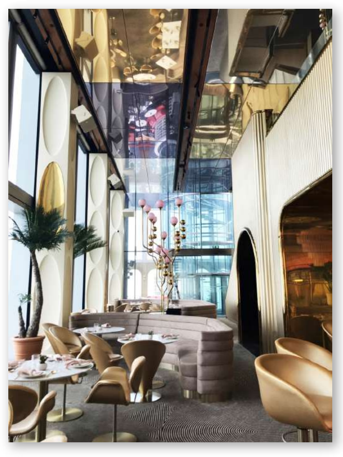
Sky Bar @ Mahanakhon