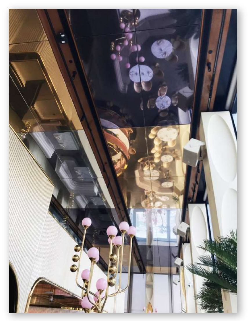
Sky Bar @ Mahanakhon