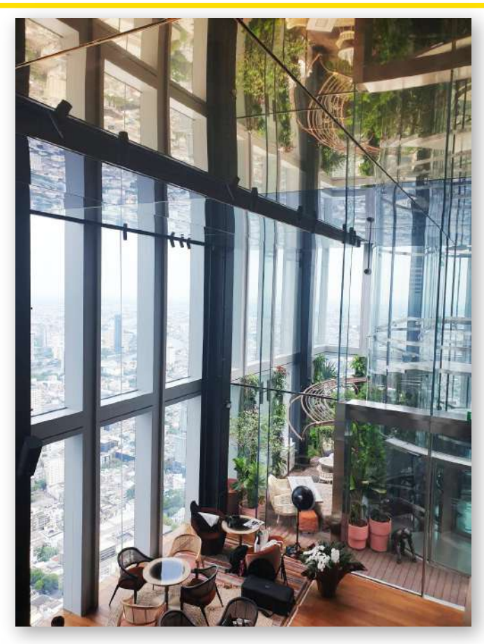
Sky Bar @ Mahanakhon