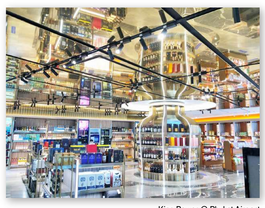
King Power @ Phuket Airport